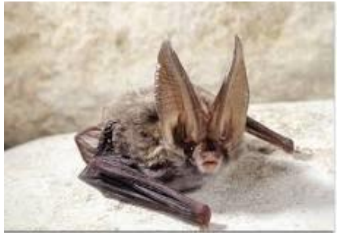
Rafinesque's Big-Eared Bat.

The Trinity River NWR is used during migration or nesting by nearly 50 percent of the neotropical migratory bird species in North America with 275 species identified on the refuge and over 200 species nesting on the refuge. It is a biodiversity hotspot with more than 650 vertebrate, 1700 insect, and 650 plant species documented on the refuge.